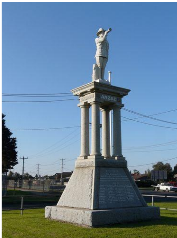
East Geelong War Memorial

N. F. Day is remembered on East Geelong War Memorial, located at St. Albans & Boundary Roads, East Geelong, Victoria.