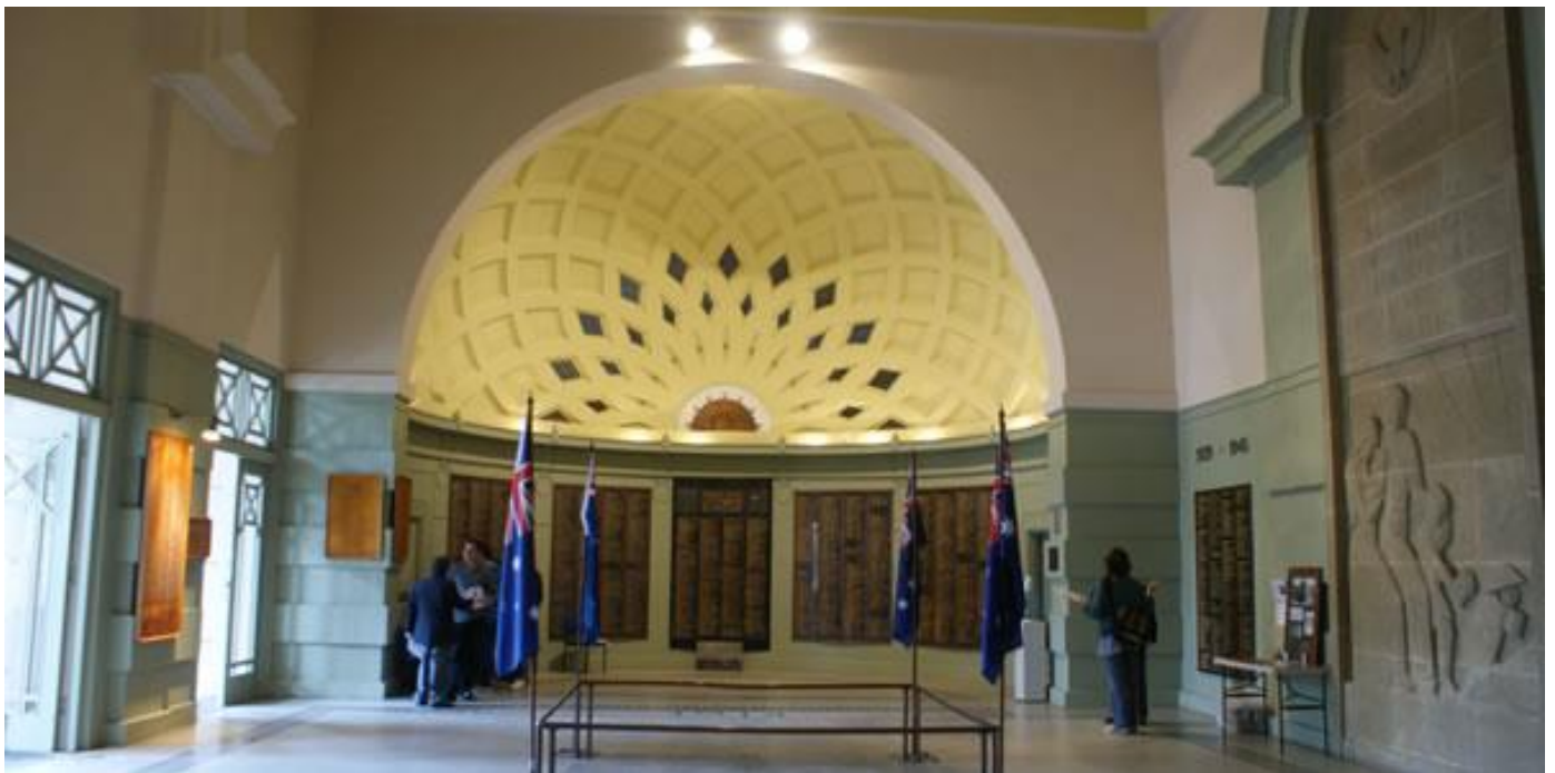
Geelong & District Fallen Roll of Honour