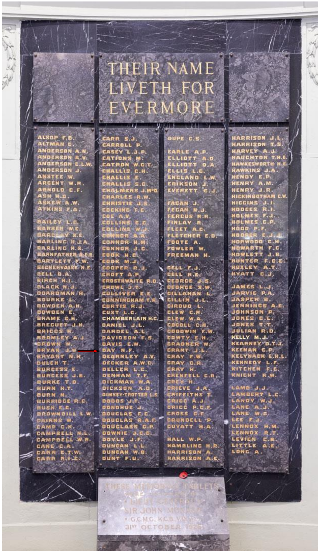
Geelong & District Fallen Roll of Honour at Geelong Peace Memorial