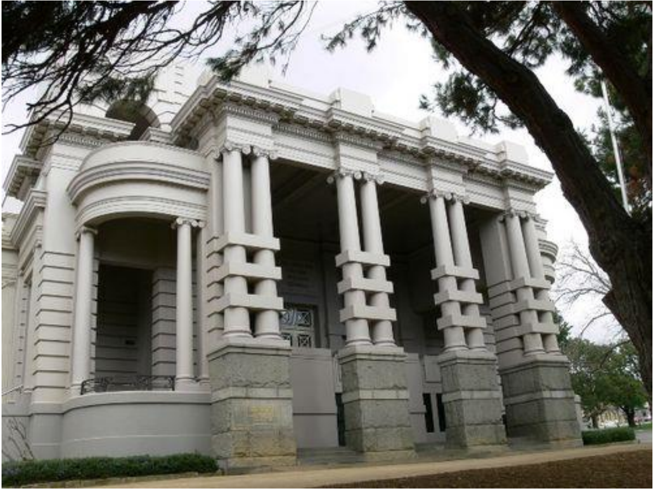
Geelong Peace Memorial