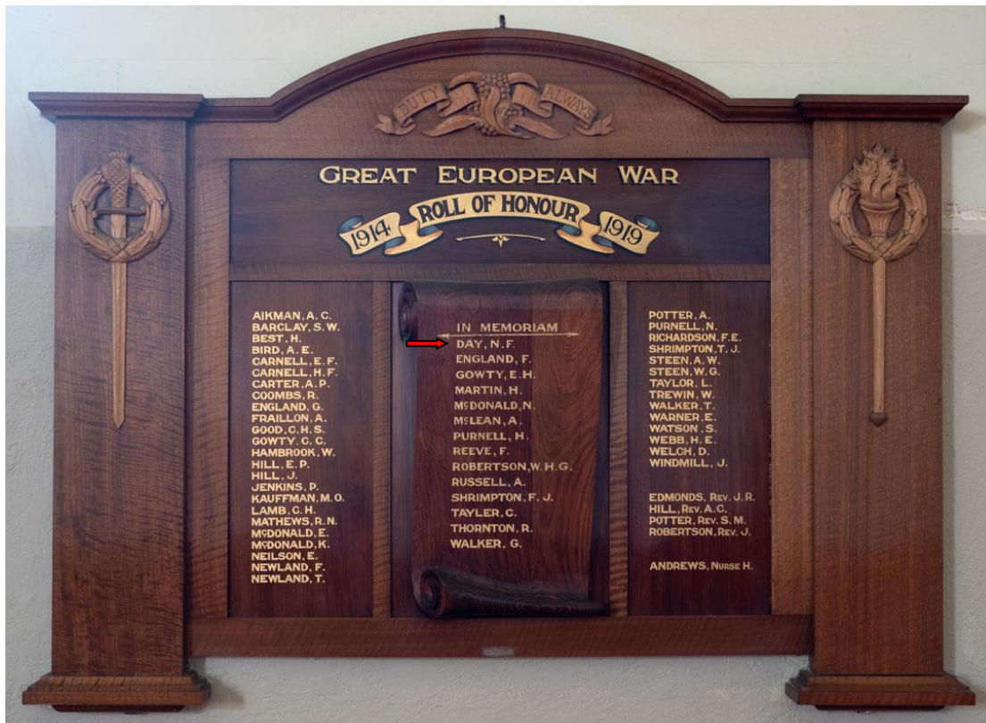
Baptist Church, Newton Roll of Honour

N. F. Day is remembered on the Baptist Church, Newton Roll of Honour, located at 7 Aberdeen Street, Newtown, Victoria.